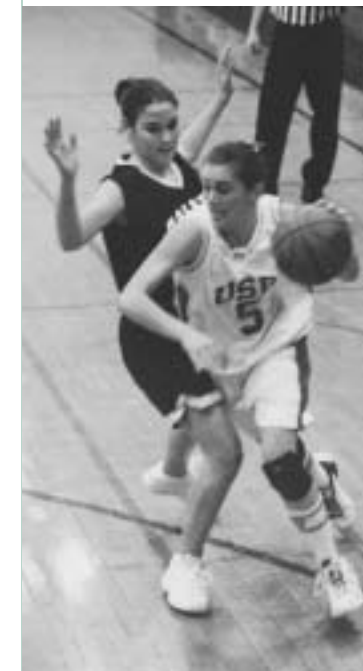
The home opener for USP's women's and men's basketball teams will take place during a doubleheader on November 22 against Philadelphia University. The women's squad will take the court at 1 p.m., followed by the men's team at 3 p.m.

The change to full Division II status comes after a four-year provisional membership in which USP had to fulfill NCAA requirements. As a result, USP varsity athletes are now eligible for NCAA postseason honors and scholarships, and all 11 USP varsity athletic teams are eligible for NCAA Championship playoffs beginning this fall. USP had been competing within the National Association of Intercollegiate Athletics (NAIA) and in the Central Atlantic Collegiate Conference (CACC), a 12-school conference within NCAA Division II comprised of teams from Connecticut, New York, New Jersey, Pennsylvania and Delaware.