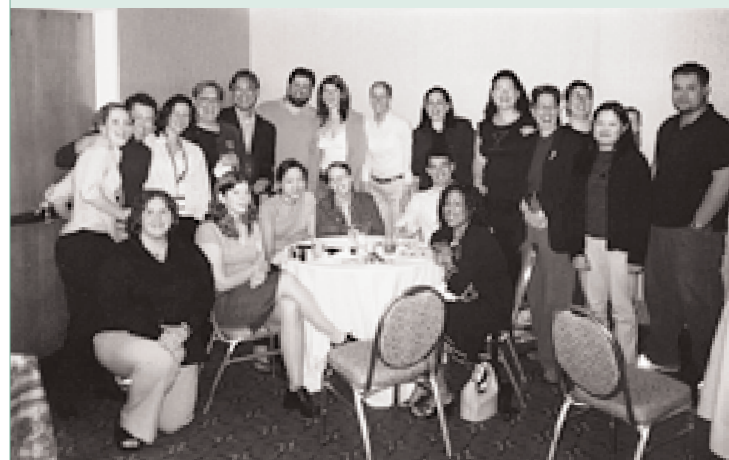
Alumni and friends gathered in Washington, D.C., during the American Occupational Therapy Association's Annual Conference.